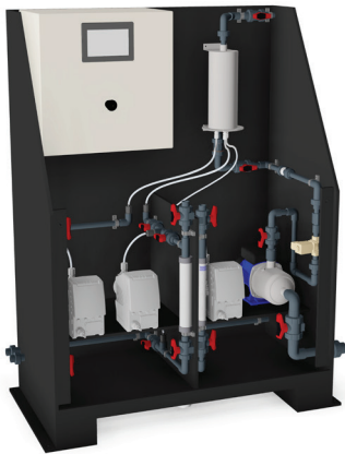
Solution tank for preparation and storage of \text{ClO}_2 solution

Yes. The CD3C generator includes a web server (as part of the HMI) and 4G router. When a 4G SIM is installed, you have 24/7 access to the HMI to view operation, download historical data, receive email alarm notifications or reset alarms. This is a powerful tool for troubleshooting to minimise service costs. Why send someone to site when most issues can be dealt with remotely? Dioxide Pacific offers Remote Access Support: a monitoring subscription service where we action alarm emails and update software.