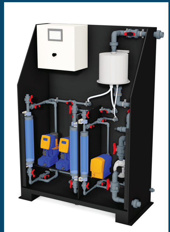
CD3C-1400 Generator. Capacity: 26,460 g/hr = 1,400 lb/day