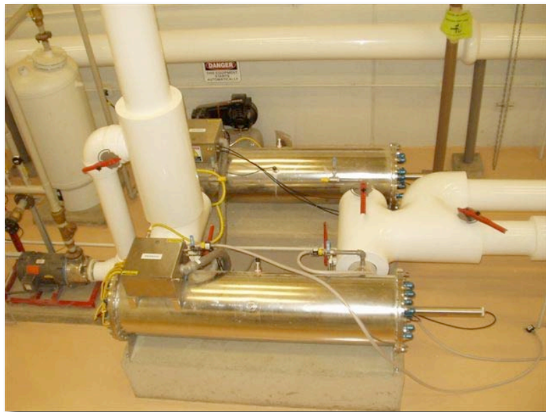
IL-6000-12-AW Installed 2007

Two vessel system incorporating low pressure amalgam lamps. Each vessel incorporates sixteen (16) amalgam UV lamps. Each system comes with automatic quartz cleaning.