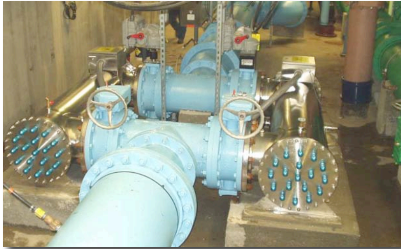
IL-6000-18-AW Installed 2003

Two vessel system incorporating low pressure amalgam lamps. Each vessel incorporates eighteen (18) amalgam UV lamps. Each system comes with automatic quartz cleaning.