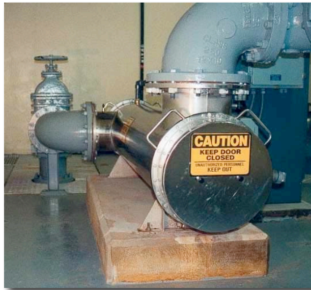
Glasco UV 40 lamp installation 1990

The following pictorial overview shows how various engineers have integrated our UV systems into their treatment plants. Units shown have been in use for over five (5) years and show indoor/outdoor installations and different inlets configurations.