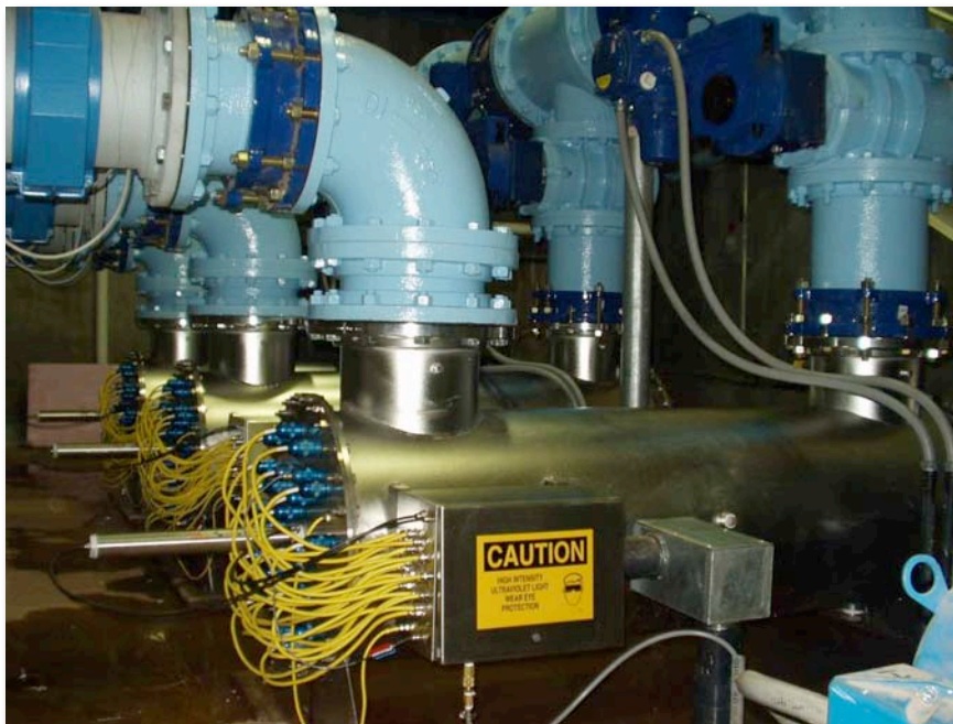
IL-6000-24-AW Installed 2007

Three (3) system incorporating low pressure amalgam lamps. Each vessel incorporates sixteen (16) amalgam UV lamps. Each system comes with automatic quartz cleaning.