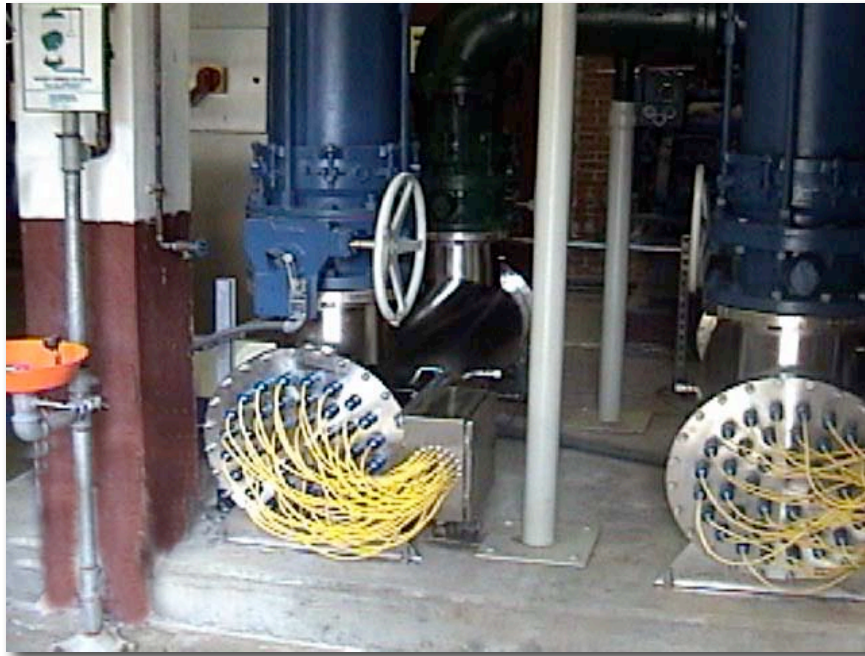
IL-4000-40-AW Installed 2003

Three (3) system incorporating low pressure amalgam lamps. Each vessel incorporates sixteen (16) amalgam UV lamps. Each system comes with automatic quartz cleaning.