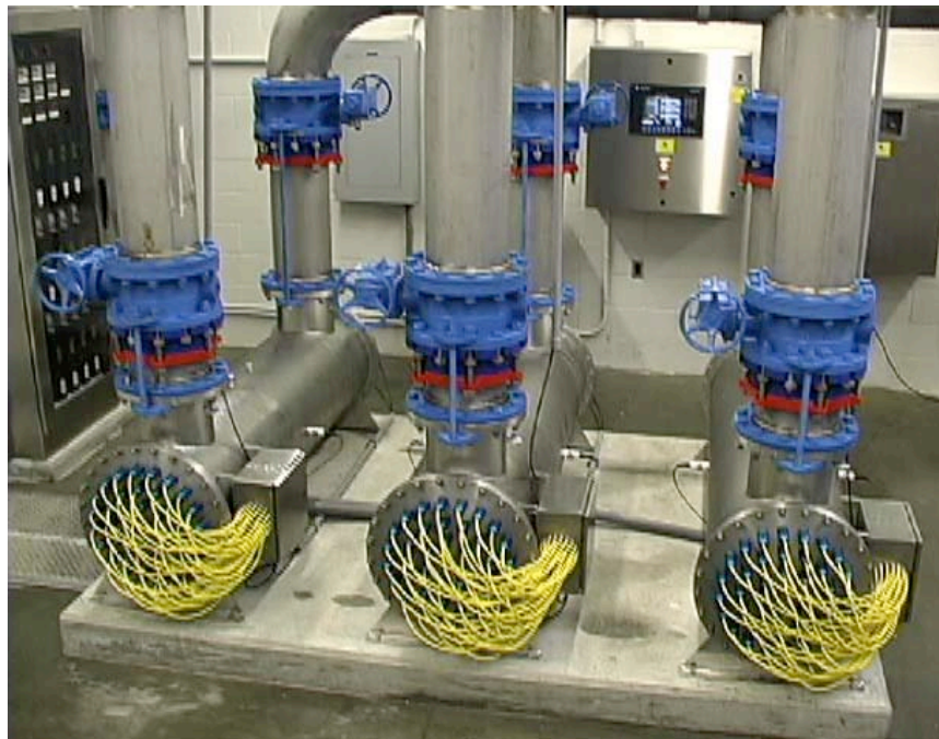
IL-4000-40-AW Installed 2004

Three vessel system incorporating low pressure amalgam lamps. Each vessel incorporates sixteen (16) amalgam UV lamps. Each system comes with automatic quartz cleaning.