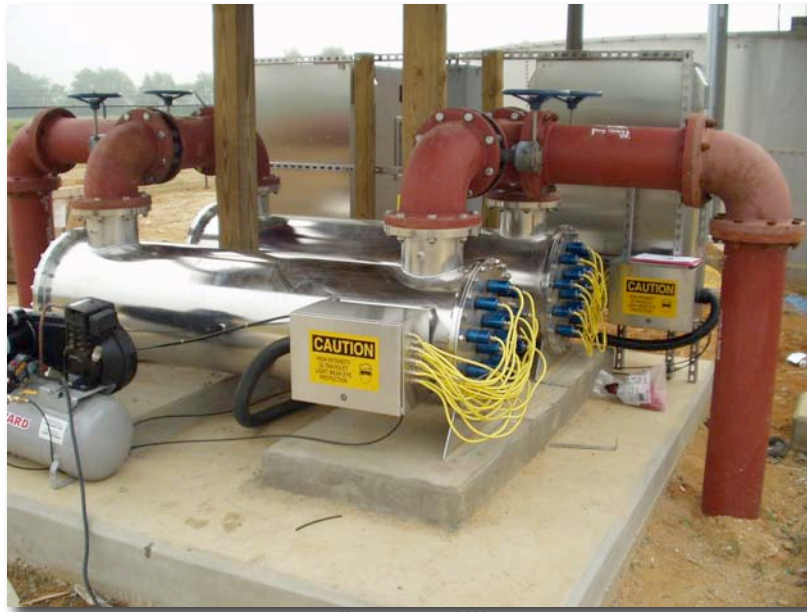
IL-6000-16-AW Installed 2005

Two vessel system incorporating low pressure amalgam lamps. Each vessel incorporates sixteen (16) amalgam UV lamps. Each system comes with automatic quartz cleaning.