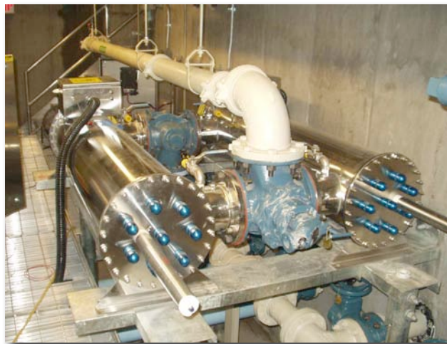
IL-6000-8-AW Installed 2007

Two vessel system incorporating low pressure amalgam lamps. Each vessel incorporates eight (8) amalgam UV lamps. Each system comes with automatic quartz cleaning.