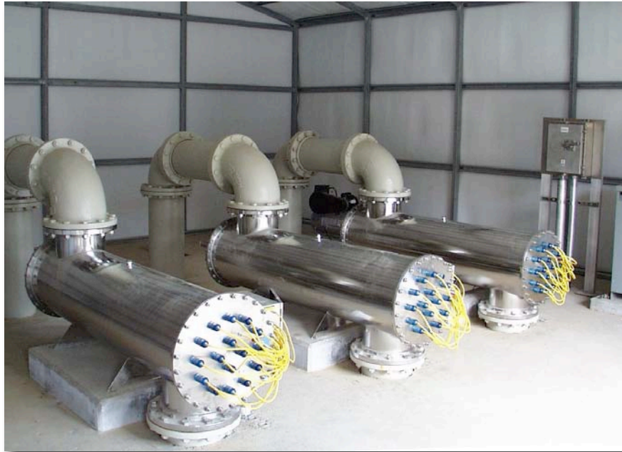
IL-6000-16-AW Installed 2005

Three vessel system incorporating low pressure amalgam lamps. Each vessel incorporates sixteen (16) amalgam UV lamps. Each system comes with automatic quartz cleaning.